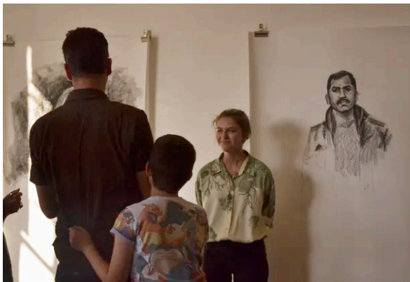
Above: Artist apprentice with her work