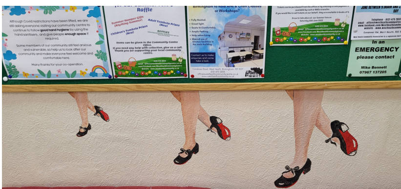
Student drawing of Tap Dancers feet