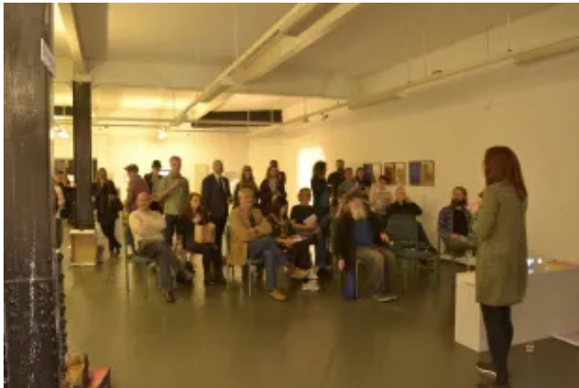
Artist talk about the installation

Discussing employment, self employment & higher ed. at Bournville College.