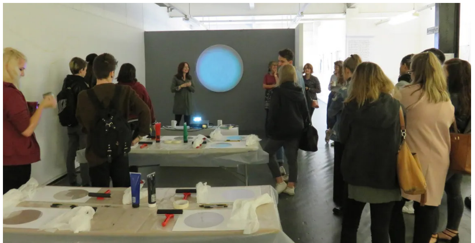
Bournville College students- Artist talk & printmaking session