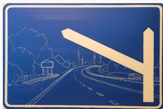
Untitled Roads 2024