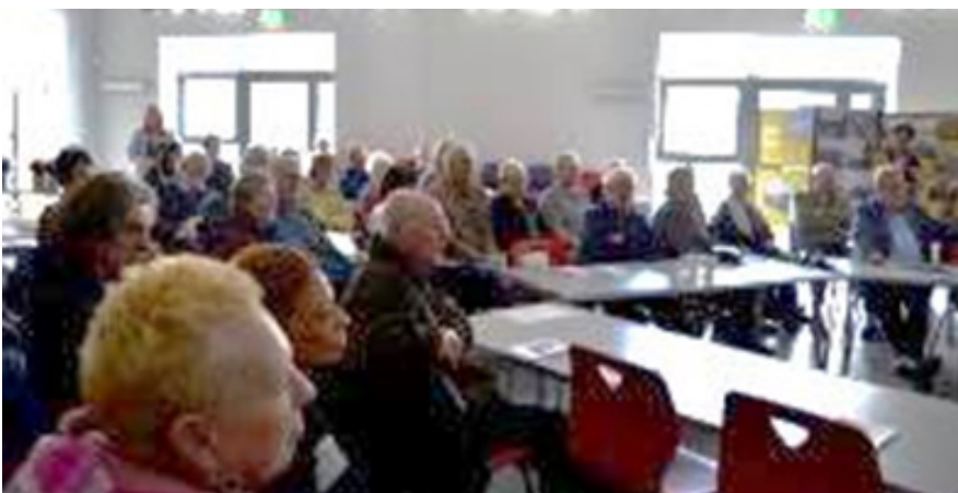
Final 'Chat about Chance' event