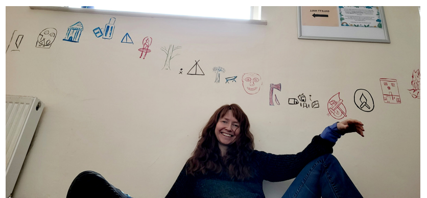
Scout, guide and cubs contribution to the community center corridors (with Rainey Community Creations)