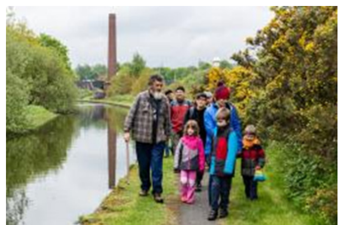
Walking tours, well attended, even when it rained!