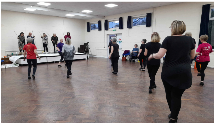
Art students draw tap dancers in motion