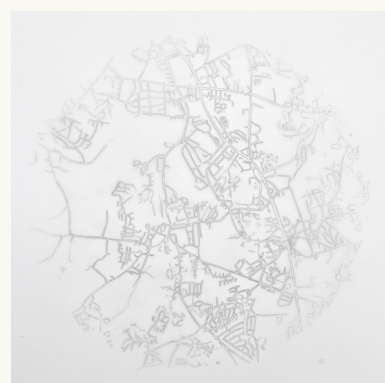
A Black Country vaguery, 2015