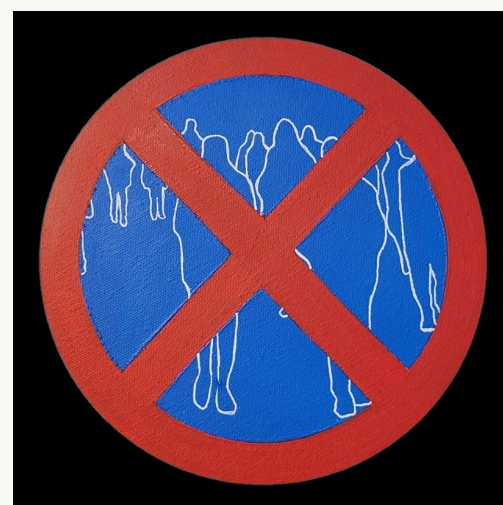
Above: Untitled Roads 2024; Acrylic on canvas