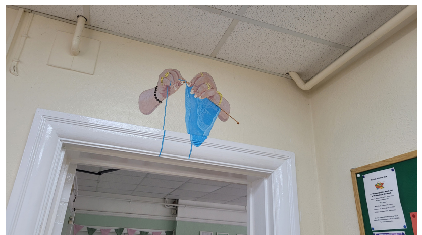
Student drawing of Knitters hands added to murals