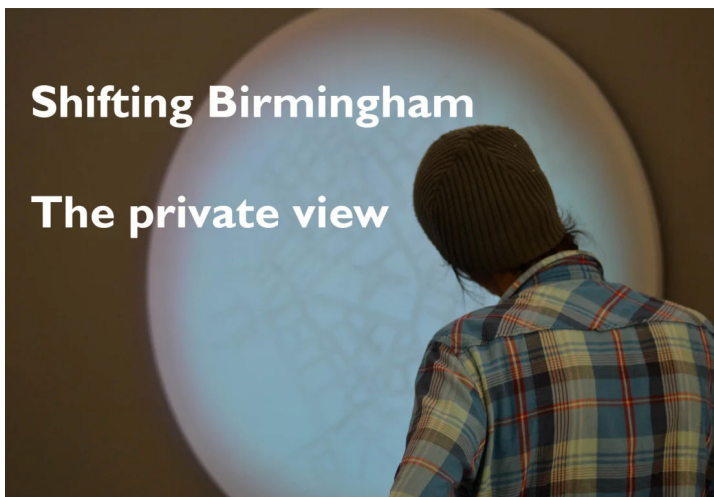
Animated map projection